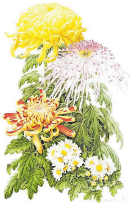
Naomi Kizaki's 2014 watercolor on paper details a Chrysanthemum morifolium .

Portland Japanese Garden visitors can study the fine details of leaves to root systems in the drawings installed at the Tanabe Gallery in the Jordan Schnitzer Japanese Arts Learning Center and the Pavilion Gallery in the Flat Garden.